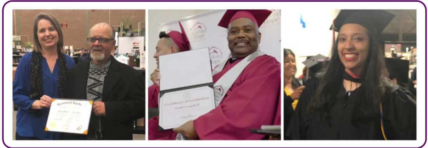
Actual NEDP graduates from various agencies

NEDP can be implemented by adult schools, K-12 school districts, community colleges, workforce development boards, libraries, social service agencies, employers, unions or any agency that partners with a diploma granting agency.