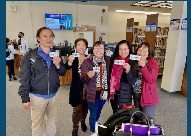
Field trip to public library