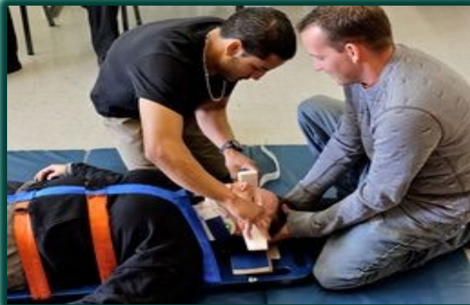
MDAE Emergency Medical Technician Program