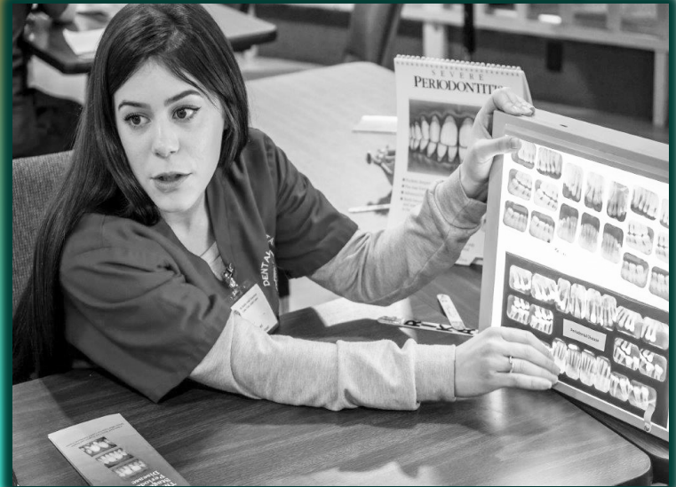
MDAE Dental Assistant Program