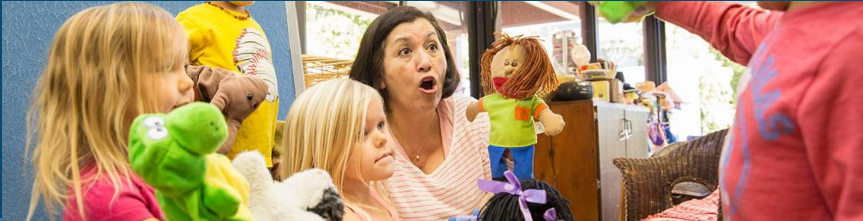
Early Childhood Education (ECE) Student