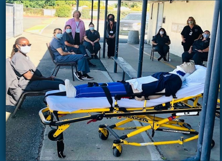
Certified Nursing Assistant (CNA) Students