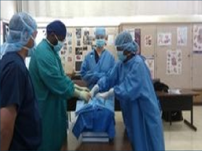
Surgical Technologist Program Students