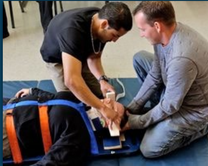
Emergency Medical Technician (EMT) Students