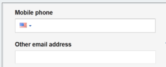
Fields for contact information

It is a good idea to confirm with your mobile phone or an alternate email in case you lose your password. Google doesn't make password retrieval easy!