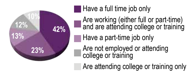
Exhibit 2 Current Status of NEDP Graduates

Of those respondents who have participated in additional educational opportunities since graduation, the most common educational program reported was enrollment in community college.