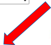
Educational Functioning Level Completion Rates

Compare your agency's data to the Average and Goal Statewide – or to another agency or region.