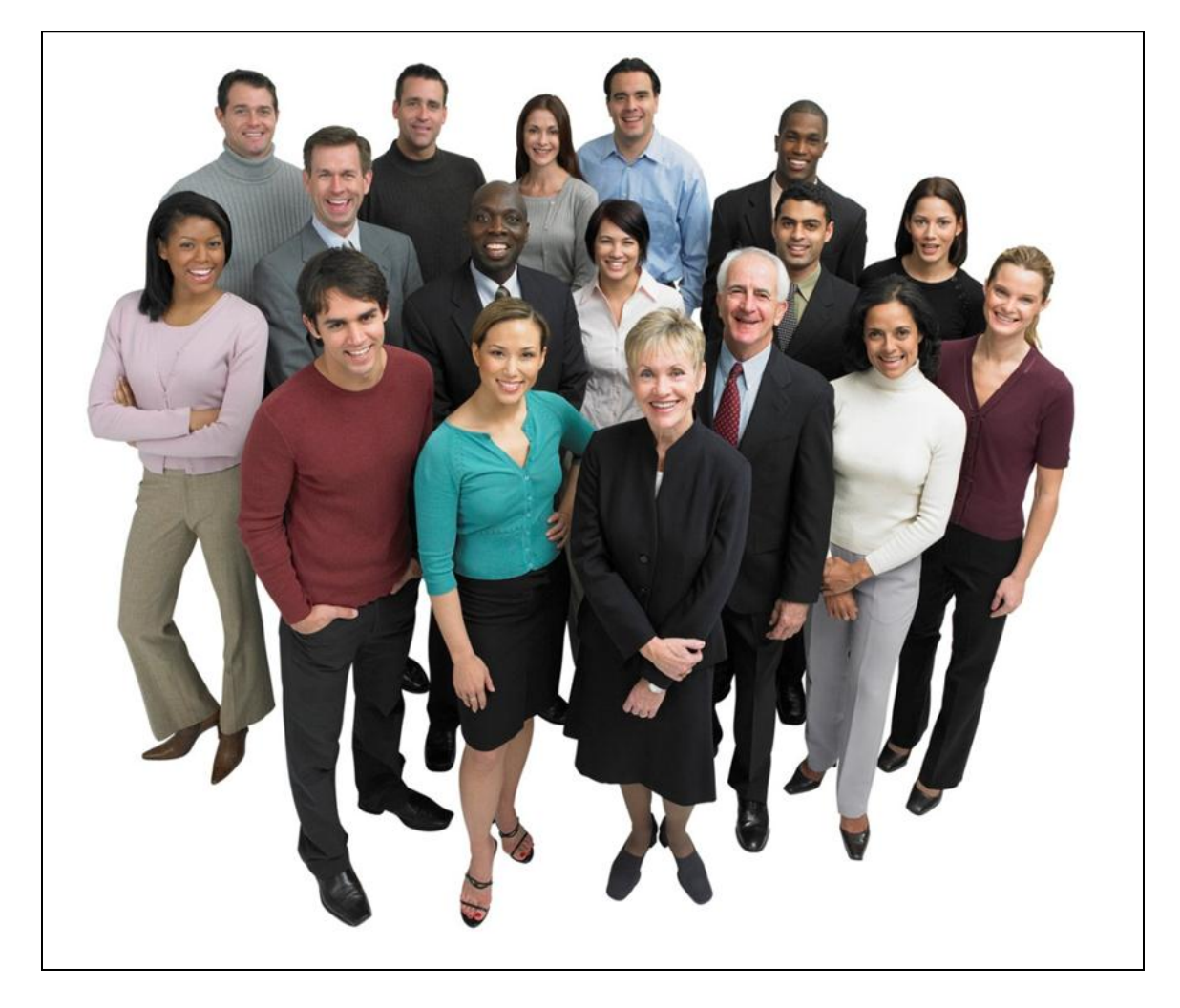
WIA II/EL CIVICS NETWORK MEETING